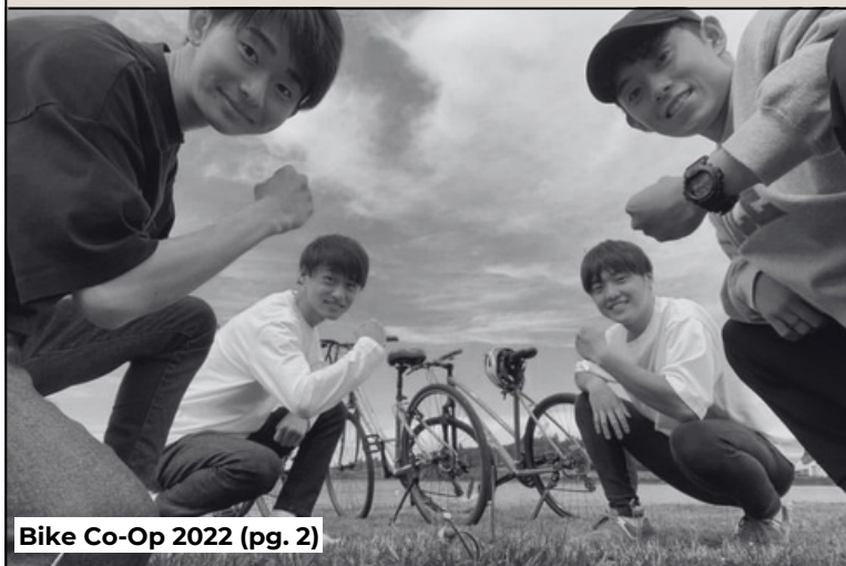
Bike Co-Op 2022 (pg. 2)

7TH JULY, 2022 | STUDENTS SERVING STUDENTS | 506-871-2601